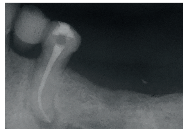
Fig. 3: Master cone coated with Bioroot<sup>™</sup> RCS, cemented, and finished with a hot plugger at orifice.

sealer cement (BioRoot<sup>™</sup> RCS, Septodont, Inc) was mixed according to manufacturer's directions. The canal was then thoroughly dried using paper points and the master gutta percha point was rolled in the sealer mix and inserted into the canal to length, using the gutta percha to coat the canal walls with BioRoot<sup>™</sup> RCS sealer. The master cone was withdrawn, recoated, and inserted to length. The gutta percha was finished at the level of the chamber with a hot plugger, and the seal was further refined using a #2 round bur. ( Fig. 1-4 ).