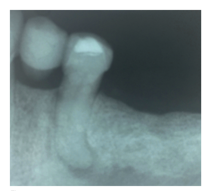
Fig. 1: Pre-Op View; Note periradicular lesion.

The canal was accessed and shaped to a #30.06 taper. Disinfection was accomplished with a 5% solution of sodium hypochlorite. The canal was flushed with anesthetic solution (Septocaine, Septodont) and followed with an EDTA/chlo-rhexidine rinse. After another rinse with anesthetic solution the canal was left to soak with 5% sodium hypochlorite. The fit and length of the #30.06 master gutta percha point was verified, then the