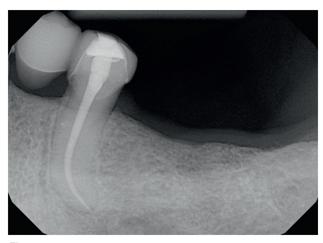
Fig. 4: One year post-op showing complete periapical healing.

sealer that overcomes the problems that were associated with earlier materials. This tricalcium silicate sealer is antimicrobial, anti-inflammatory, bonds to dentin, and remains dimensionally stable, so that it better meets the stated objectives of root canal sealer materials. According, it is not necessary to use substantial force to compact the gutta percha into the prepared canal, since this sealer will fill voids and prevent bacterial colony formation. Since this sealer neither shrinks nor degrades, micro leakage is prevented apically and coronally. Also, the gutta percha used in this technique slides consist-ently to length thus making obturation simpler and less likely to result in a root fracture. In addition, not having to create excessive taper strengthens the tooth by preserving the coronal dentin of the root canal preparation.